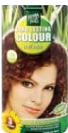
Café Latte 7.54