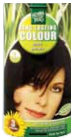
Dark Brown 3