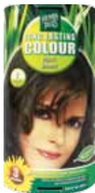
Dark Blond 6