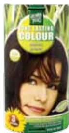
Mocha Brown 4.03