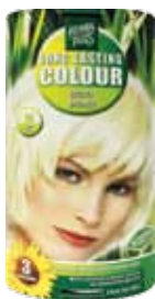
Ultra Blond 00