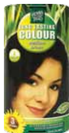
Medium Brown 4