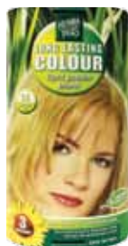
Light Golden Blond 8.3