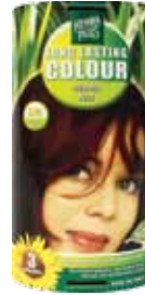
Henna Red 5.64