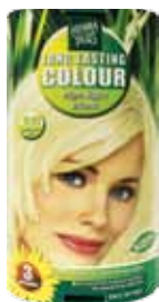
Highlight Blond 10