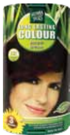
Purple Dream 6.67