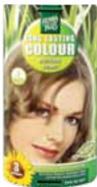
Medium Blond 7