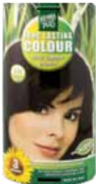
Dark Copper Brown 3.44