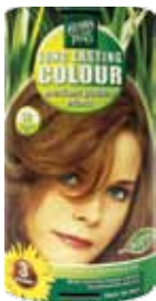
Medium Golden Blond 7.3