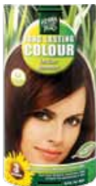
Indian Summer 5.4