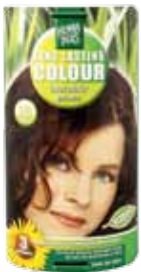
Chocolate Brown 5.35