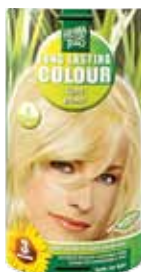
Light Blond 8