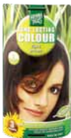
Light Brown 5