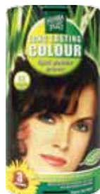
Light Golden Brown 5.3