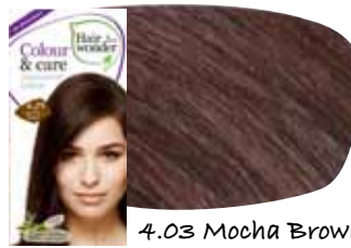
4.03 Mocha Brown HP12009