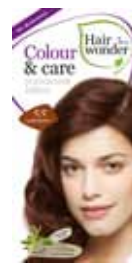
5.5 Mahogany HP12015