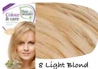
8 Light Blond HP12001