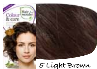
5 Light Brown HP12006