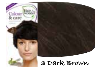
3 Dark Brown HP12011