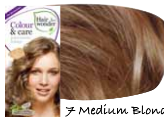
7 Medium Blond HP12002