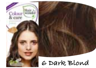
6 Dark Blond HP12004