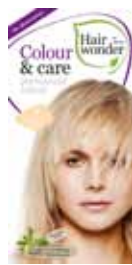
9 Very Light Blond HP12013