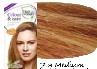
7.3 Medium Golden Blond HP12003