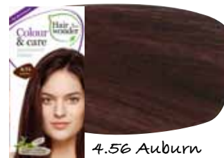
4.56 Auburn HP12010