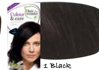
1 Black HP12012