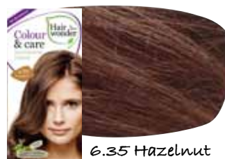
6.35 Hazelnut HP12005