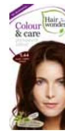
3.44 Dark Copper Brown HP12017