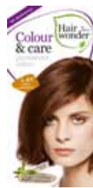
6.45 Copper Mahogany HP12014