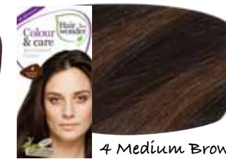
4 Medium Brown HP12008