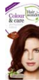
5.64 Henna Red HP12016