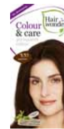
3.37 Espresso HP12018